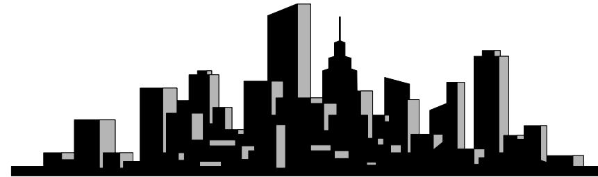
Urban Environment in Brazil