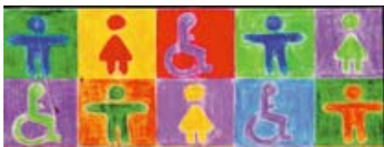
Drawing by Marina Wirlitsch, European Year of People with Disabilities 2003

People with disabilities should receive equal treatment at work. This includes equality regarding health and safety at work. Health and safety should not be used as an excuse for not employing or not continuing to employ disabled people. In addition, a workplace that is accessible and safe for people with disabilities is also safer and more accessible for all employees, clients and visitors. People with disabilities are covered by both European anti-discrimination legislation and occupational health and safety legislation. This legislation, which the Member States implement in national legislation and arrangements, should be applied to facilitate the employment of people with disabilities, not to exclude them.