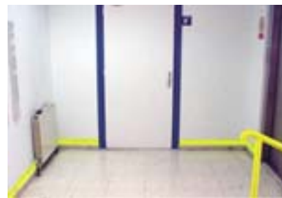
Colour contrast helps mobility

European Agency for Safety and Health at Work Gran Vía, 33, E-48009 Bilbao Tel. (34) 944 79 43 60, fax (34) 944 79 43 83 E-mail: information@osha.eu.int